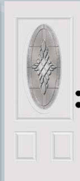
VS91GR30 Satin Nickel Hinges/Caming