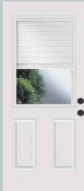
VS61MB28 / VS61MB30 Satin Nickel Hinges