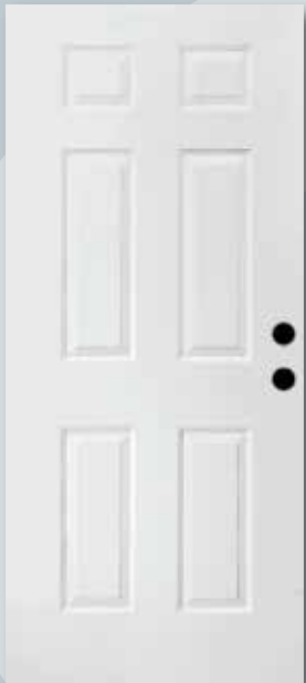
VS6028 / VS6030 Satin Nickel Hinges