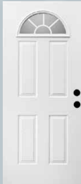
VS70M30 Satin Nickel Hinges